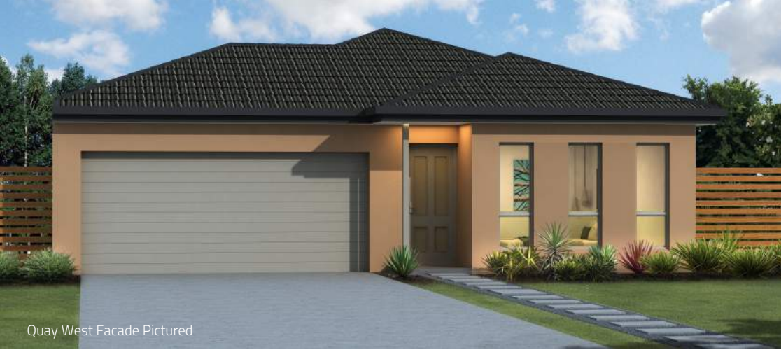
Quay West Facade Pictured