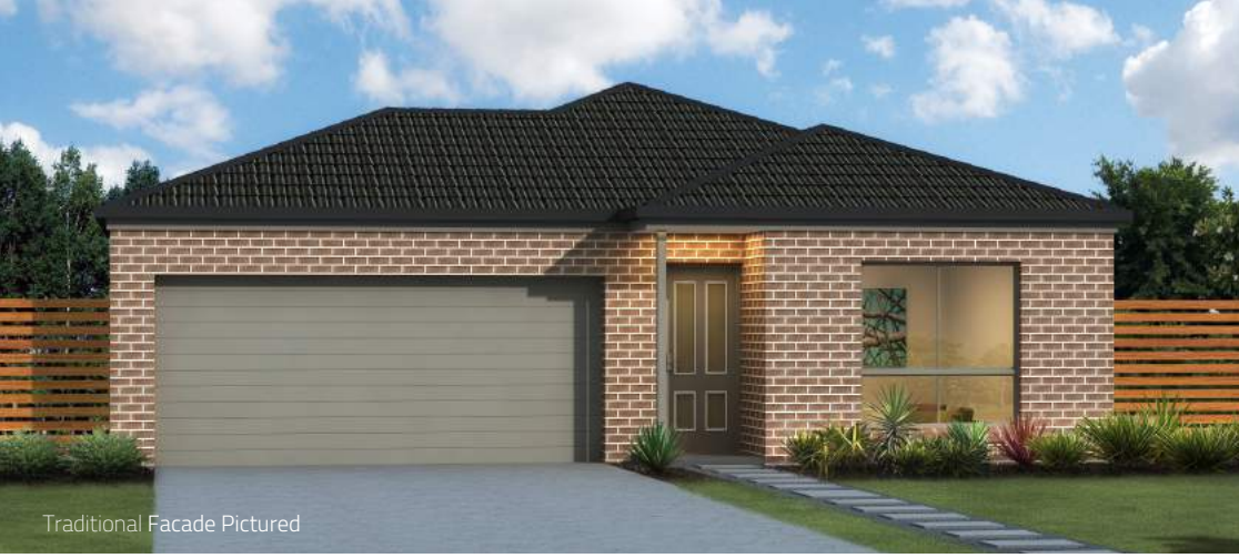
Traditional Facade Pictured